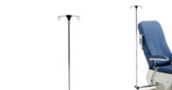
AP4099B -I.V. POLE SUPPORT FOR ART. 40.95/40.96