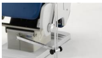
AP4099 -ADJUSTABLE ARM FOR ACCESSORIES