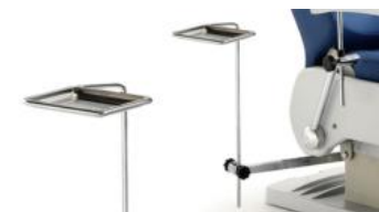
AP4099A -INOX BASIN SUPPORT FOR ART. 40.95/40.96