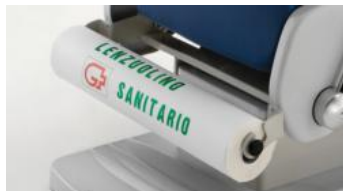
AP4097P -PAPER HOLDER FOR MULTIFUNCTIONAL CHAIR