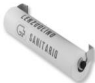
MZ1048 -PAPER ROLL SUPPORT FOR MR1... ARMCHAIRS