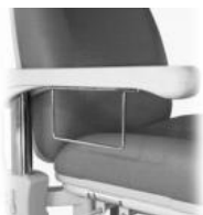
MZ5062 -URINE BAG HOLDER