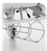
MZ5120 -OXYGEN TANK HOLDER FOR RELAX ARMCHAIRS WITH FIXED HIEGHT