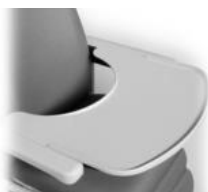
MZ5061 -SERVING TABLE