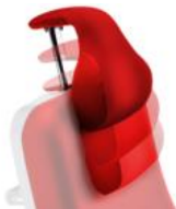
MZ1059 -HEADREST FOR MR1... RELAX ARMCHAIRS - STANDARD COLOR