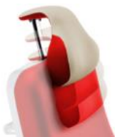
MZ1058 -DOUBLE-COLOR OR SINGLE-COLOR HEADREST FOR MR1... RELAX ARMCHAIRS