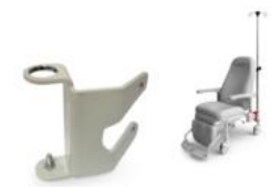
MZ5164 -LEFT CLAMP FOR MZ5149 I.V. STAND