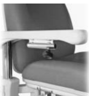
MZ5066 -COUPLE OF STEEL RUNNERS FOR TRAY