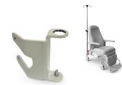
MZ5163 -RIGHT CLAMP FOR MZ5149 I.V. STAND