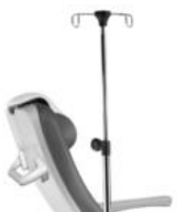
MZ5149 -I.V. STAND WITH ADJUSTABLE HEIGHT FOR MZ5163/5164 CLAMPS